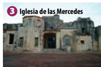
3 Iglesia de las Mercedes