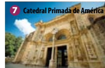
7 Catedral Primada de América