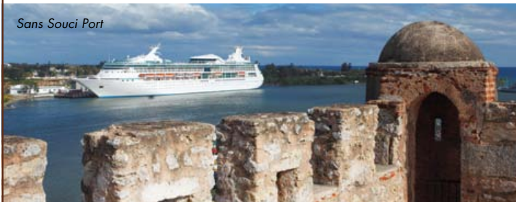
Sans Souci Port