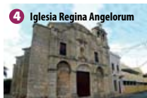
4 Iglesia Regina Angelorum