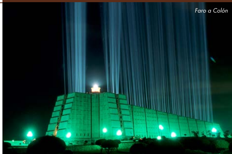
Faro a Colón

MALECÓN – An 8-mile (14 kilometer) maritime boulevard fringed by palm trees, the Malecón is lined with benches for sitting and admiring the Caribbean Sea. Referred to as the Caribbean Seaside Boardwalk of Santo Domingo, the Malecón was recognized by the international organizers of American Capital of Culture 2010 as one of the city's seven material cultural treasures. The Malecón runs along George Washington Avenue and is one of the most attractive avenue in the city, famous for nearby restaurants and entertainment, as well as for maintaining most of the major five-star hotels.