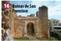
16 Ruinas de San Francisco