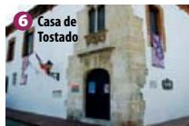
6 Casa de Tostado