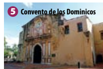
5 Convento de los Dominicos