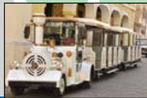
Chu Chu Colonial. Explore the historic sites of the Colonial City on board this train. Non-stop 45min tour from 9 to 5pm.

© 2012 PRO RD S.A. (dri.com) Email: info@dri.comps.com • Tel. 809 769 9560