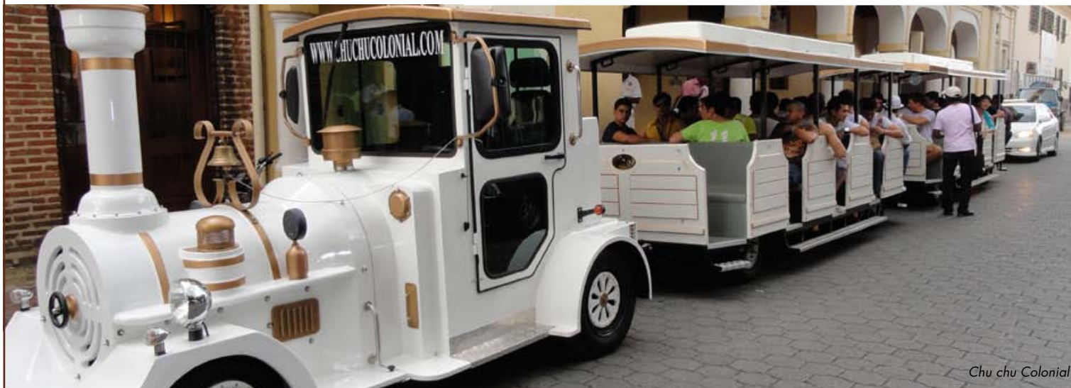
Chu chu Colonial