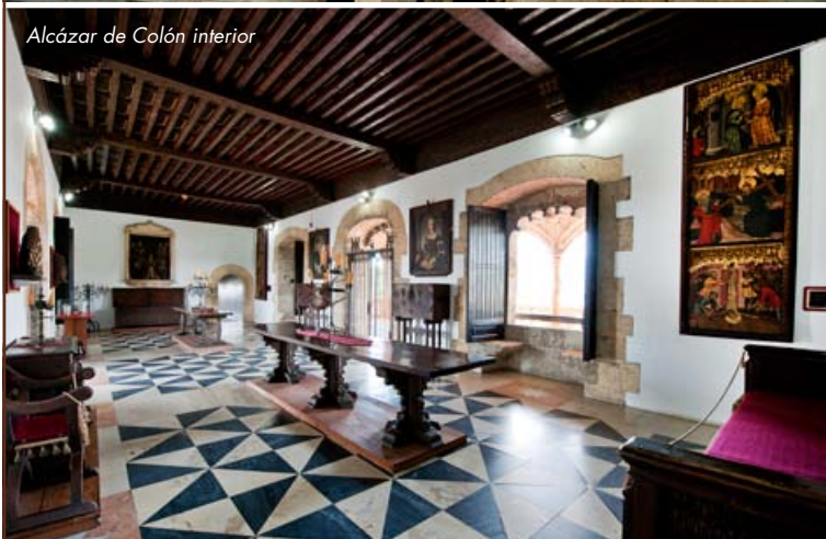
Alcázar de Colón interior

SANTO DOMINGO'S COLONIAL CITY – The Colonial City was the first city established in the New World and was erected by Columbus' brother Bartholomew and Bartholomew's son Diego. Thanks to its historical and cultural value, the Colonial City was recognized by UNESCO and declared a world Heritage Site in 1990. Visitors will find hundreds of preserved buildings dating back to the early 1500's, many of which are now museums. Among them are Alcazar de Colon (Diego's home), Ozama fortress and the palace of the Spanish court. A few streets over, in the center of the walled city, visitors will find the Cathedral of Santo Domingo, which was deemed the first cathedral in the New World by Pope Paul III in 1542.