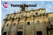
10 Panteón Nacional