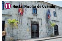
11 Hostal Nicolás de Ovando