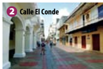
2 Calle El Conde