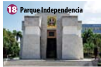
18 Parque Independencia