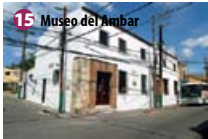
15 Museo del Ambar