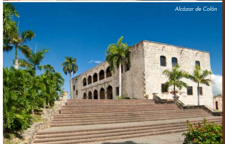
Alcázar de Colón