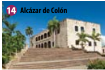
14 Alcázar de Colón