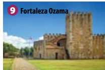
9 Fortaleza Ozama