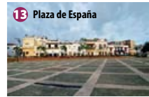
13 Plaza de España