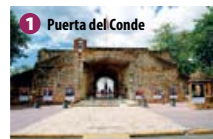
1 Puerta del Conde

© 2012 PRO RD S.A. (dri.com) Email: info@dri.comps.com • Tel. 809 769 9560