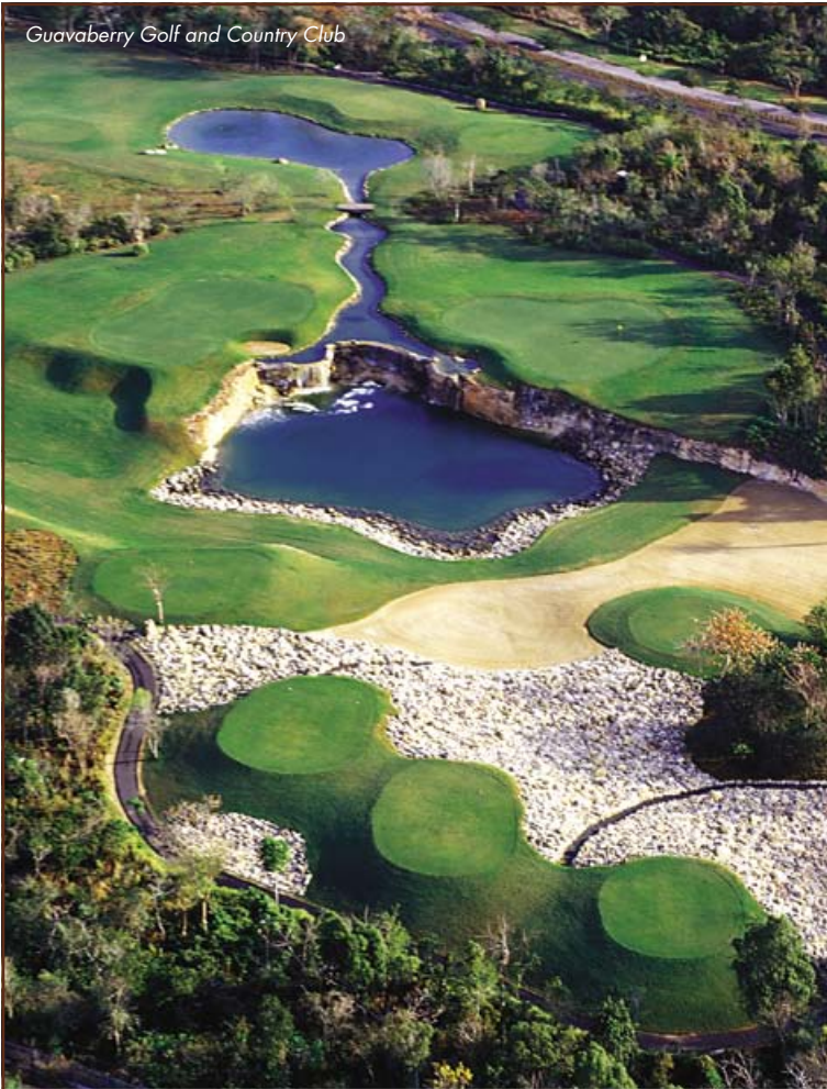
Guavaberry Golf and Country Club