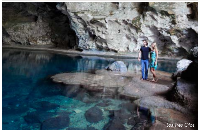
Los Tres Ojos