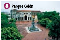
8 Parque Colón