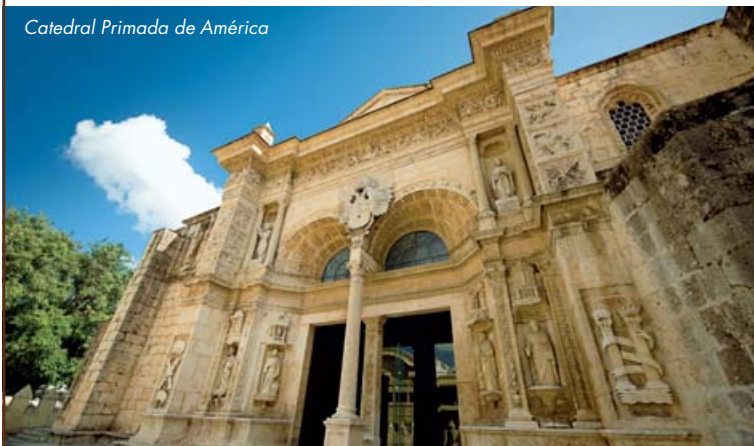
Catedral Primada de América