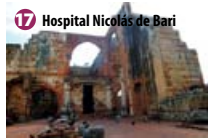
17 Hospital Nicolás de Bari