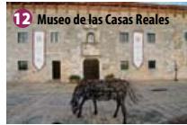
12 Museo de las Casas Reales