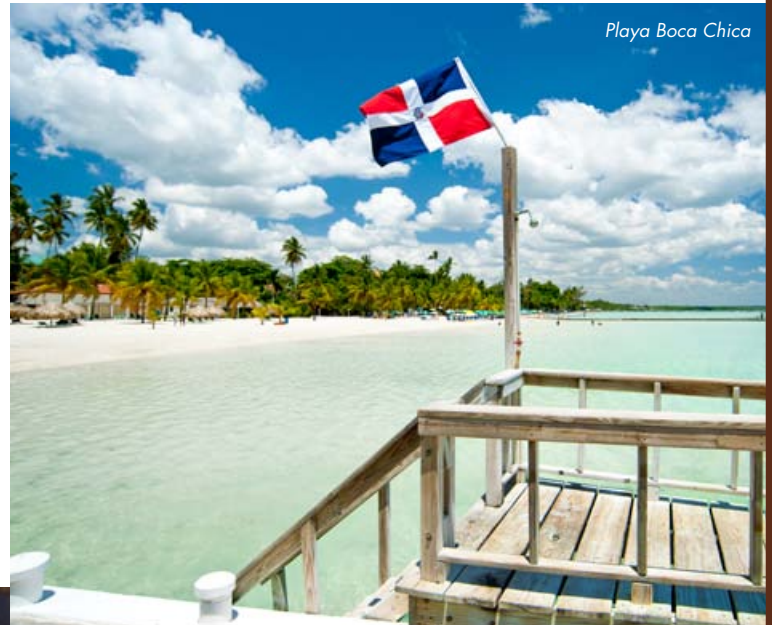
Playa Boca Chica

PLAYA BOCA CHICA – Boca Chica beach lies 20 miles (30 kilometers) east of Santo Domingo. The city beach, which is famous for its powdery-white sand, attracts large crowds on weekends, and vendors can be found selling everything from massages to seafood to necklaces. Lined with outdoor restaurants and majestic views, Boca Chica Beach is home to attractive marinas that cater specifically to boating and sailing pursuits.